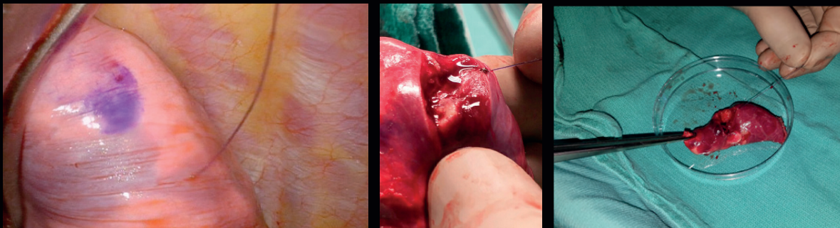
Figure 3: The fiducial marker string can be seen in the endoscopic view (left) and then the T-fastener marker is also shown within the specimen (middle, right).